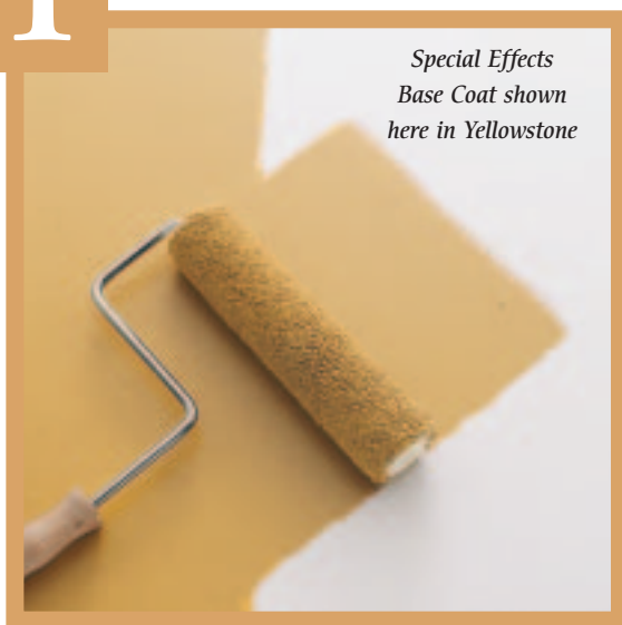
Special Effects Base Coat shown here in Yellowstone

Before starting this technique, mask woodwork, floors, ceiling and corners. Applying McCloskey® Special Effects™ Base Coat is as simple as applying any latex wall paint. Follow label directions to ensure the best results. Begin by cutting in corners and edges with a high-quality nylon-bristle brush. Paint large areas with a high-quality short, 3/8" nap roller cover. Finish each area by rolling full length from ceiling to floor to eliminate lap marks. Allow to dry for a minimum of 4 hours, or overnight.