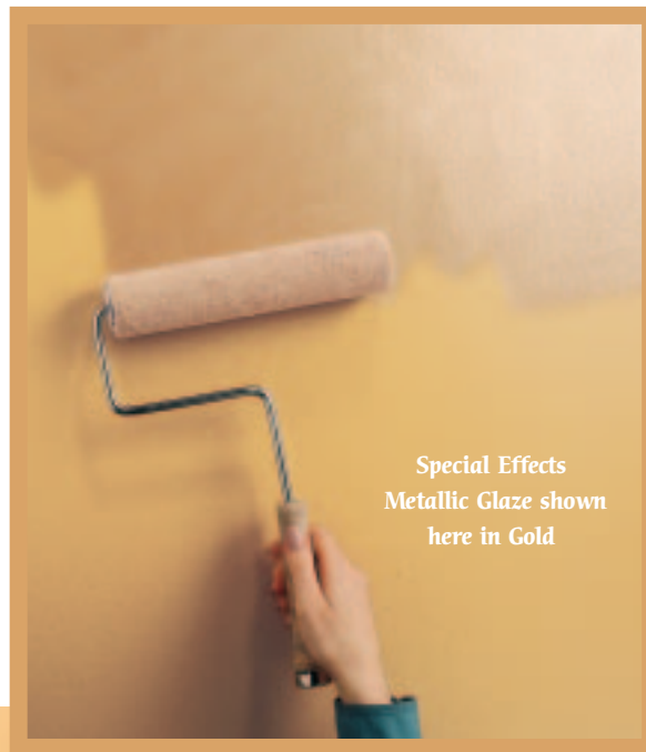
Special Effects Metallic Glaze shown here in Gold

Reapply tape, if necessary. Using a premium-quality nylon brush or a roller with 3/8" nap, apply an even coat of Metallic Glaze in Gold, Silver, Copper or Bronze. Apply glaze in a 4 to 6-foot-square area, using natural breaks such as doors, windows and corners as stopping points.